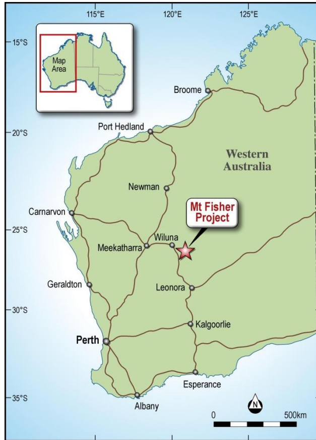
Figure 1: Mt Fisher Project Location